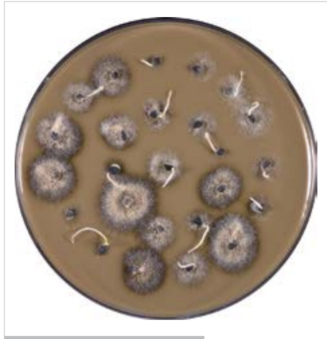
Figure 6. Neck rot fungi growing out of infested onion seeds on selective agar

Neck rot is primarily seed-borne. Infested seed (Figure 6) can be contaminated externally and/or internally and the pathogen may survive on seed for several years. Infested seeds give rise to infected seedlings as a result of direct infection of the tips of the cotyledons from spores or mycelium on or within the seed coat during germination and emergence. Within a plant, Ba then infects successively produced leaves and only sporulates when the leaves senesce and die (Figure 7).