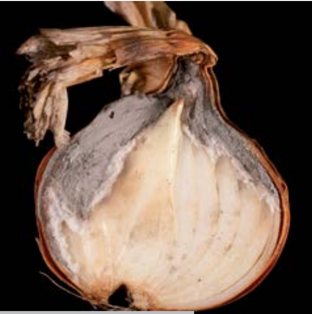
Figure 3. Whitish mycelium and masses of grev spores (conidia) develop on infected tissues