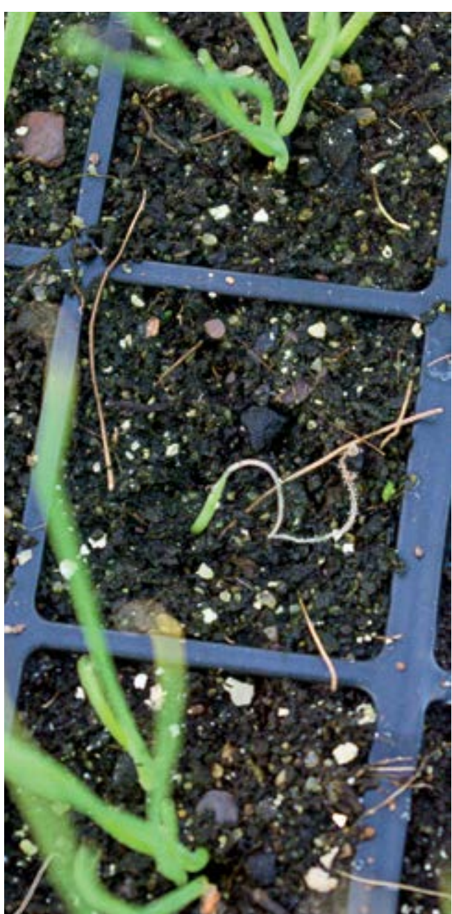
Figure 7. B. allii sporulating on the cotyledon of a dying seedling