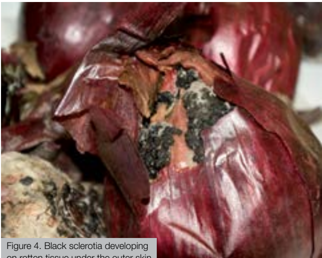
on rotten tissue under the outer skin