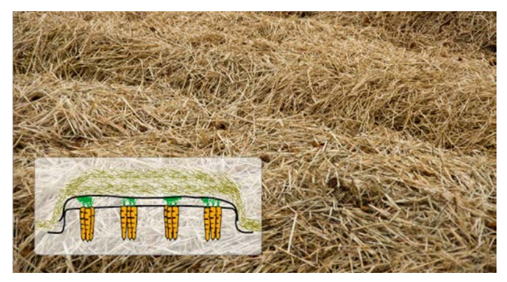
Figure 7. Conventional straw over poly. Straw at 1/3rd rate with poly cover to keep drier and maximise insulation

Growers planning long-term field storage of crops generally use straw over poly. The introduction of a polythene layer provides additional insulation through surface resistance to heat transfer and, so, provides slightly greater insulation than straw alone. However, the most important effect of the polythene was that the straw remains much wetter than straw alone (up to twice the moisture content), and often with free water on the surface of the polythene. Based on moisture contents of the straw at the final harvests, the water content was equivalent to as much as 14kg/m<sup>2</sup>. This larger amount of water provides a greater thermal mass, greater potential latent heat effects and evaporative cooling. Thus, not only is the crop more protected from freezing, but it also heats up more slowly in the spring (ie is kept within a narrower temperature range than the other treatments).