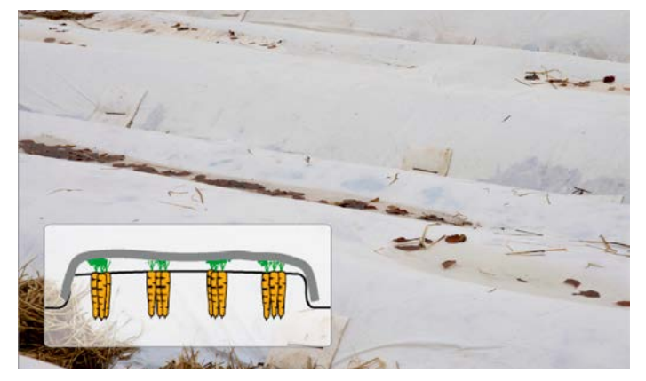
Figure 9. Closed-cell polyethylene foam. Used for camping mats, insulation value is unaffected by moisture

This treatment consisted of a 1.8m wide, 7.5mm thick layer natural/white closed-cell polyethylene foam laid directly over the crop and secured with a wider layer of white polythene over the top. The material is relatively expensive and would only be cost-effective if reused. It is available in different thickness, but thicker versions increase cost. We therefore examined the thinnest version with a view to using it on its own for earlier harvests or as an adjunct to other materials. The great advantage of this material is that the closed-cell nature (ie air is trapped in closed cells) means its insulation properties are unaffected by moisture, unlike, eq rockwool insulation and similar materials used in buildings. Based on the theoretical predictions, it was expected that this treatment would have the lowest insulation value, and this proved to be the case. Nevertheless, it still provided adequate protection at all sites in both years, and we were able to recover it intact for reuse at the end of each year.