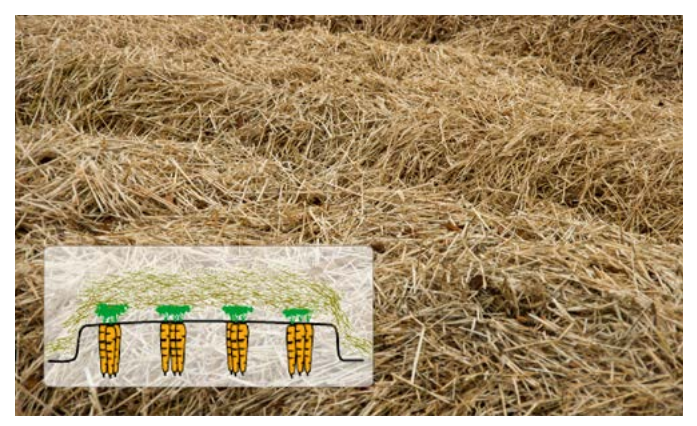
Figure 6. Conventional straw only

Growers tend to use straw alone for shorter-term crops, or when the crop may be processed and some damage to crowns is acceptable. This treatment provided less insulation than straw over poly. The straw remains wet at the bottom (but not as wet as straw over poly), and