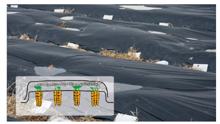
Figure 12. Poly over fibre. Aiming to keep the fibre drier and maximise insulation

This treatment was examined in the second year and was essentially a modification of the poly-fibre sandwich from the first year, modified by removal of the bottom layer of polythene, as it was found that due to the smooth surface of the polythene, the fibre tended to fall off the shoulders of the beds, resulting in an variable depth or absence of