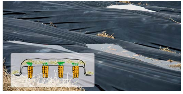
Figure 8. Poly over reduced straw

This was a modification of a reduced-straw polythene sandwich treatment examined in the first year of trials; simplified by omission of the polythene layer below the straw and using a minimal amount of straw in the wheelings to anchor the polythene.