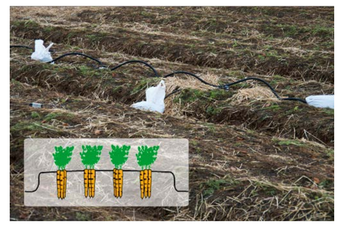
Figure 5. Uncovered control

This treatment was included as a negative control. Inevitably, the harvested carrots had significant levels of frost damage, and reduced marketable yields compared to the covered plots.