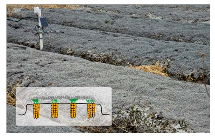
Figure 10. Cellulose fibre. Used for house insulation, made from waste paper. Absorbs a lot of water

This treatment was envisaged as the simplest way to make use of the cellulose fibre on a commercial field scale. The product was blown onto the crop using a petrol leaf blower with a flexible outlet. The rate used (1.75kg/m<sup>2</sup>) was the same as used in the other fibre treatments, and intended to give a 5cm depth of material. There was concern that the material would not stay in place on the crop without a cover but this proved to be unfounded. The carrot foliage trapped the initial fibres, and there was very little drift off the target bed. In addition, once the surface had been wetted by the first rain or dew following the initial application, the top layer of material formed a crust, and stayed locked in place for the duration of the winter until harvest.